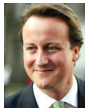
Rt Hon David Cameron Former Prime Minister

ZANE does an excellent job for the people of Zimbabwe. I wish the charity really well in 2018.